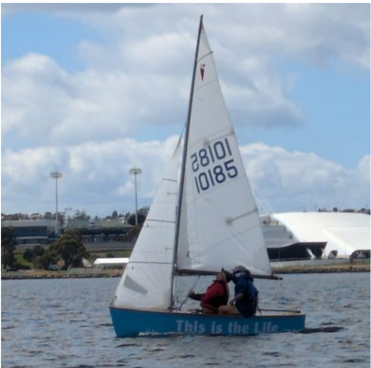
Celeste sailing 10185 This is the Life