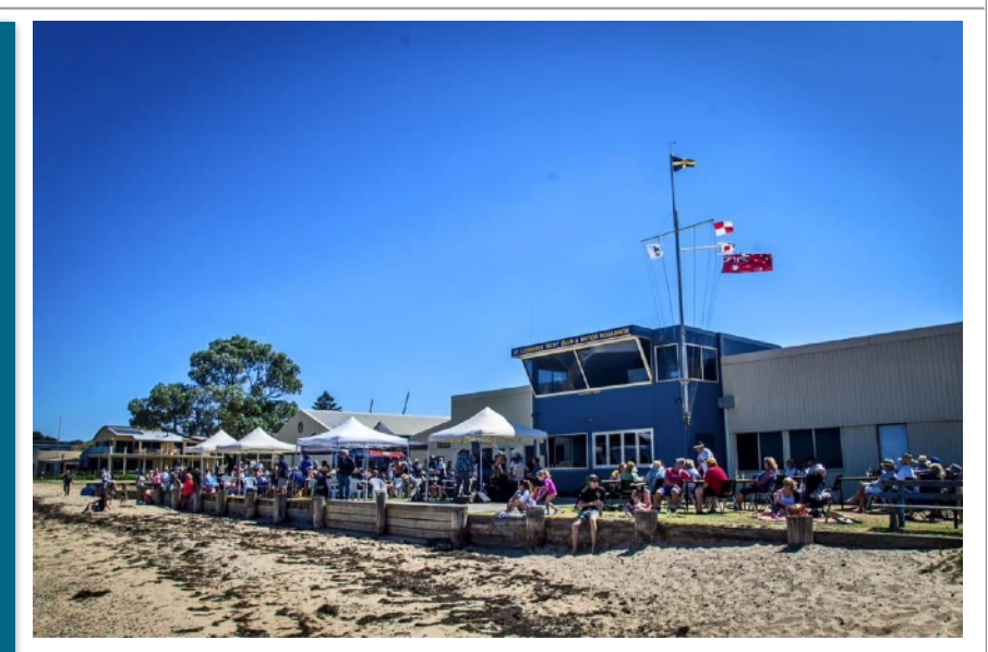
Host to the 64th Heron Nationals, St Leonards Yacht Club and Motor Squadron

Hi everyone, welcome to the December edition of the Heron Newsletter.